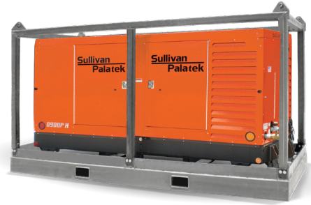
375-1600 CFM Offshore