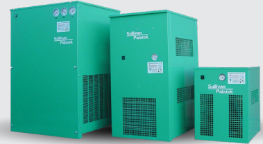
Refrigerated Air Dryers