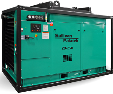
Electric Construction Compressors