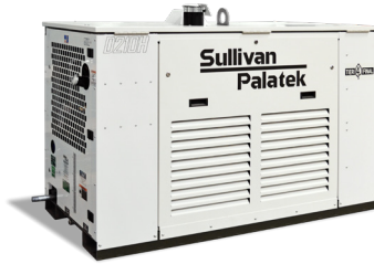
Utilities 110-260 CFM