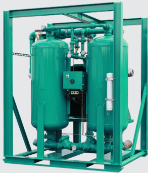
Aftercooler/Dryer Skid Packages