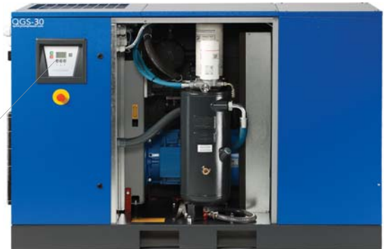
Quincy QGS 30 shown with optional integrated dryer