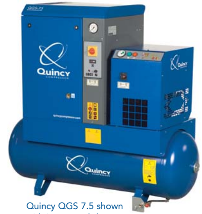
Quincy QGS 7.5 shown with integrated dryer

Quincy understands the critical nature of your compressed air system to maintain production while simultaneously ensuring the profitability of your company. Quincy's QGS line of compressors help drive your profitability by lowering your total cost of ownership while providing you with the performance and reliability that people have come to know and expect from Quincy compressors. The QGS air compressor has many of the features, benefits, and advantages of larger compressed air systems in a package that fits your application and at a price you can afford.